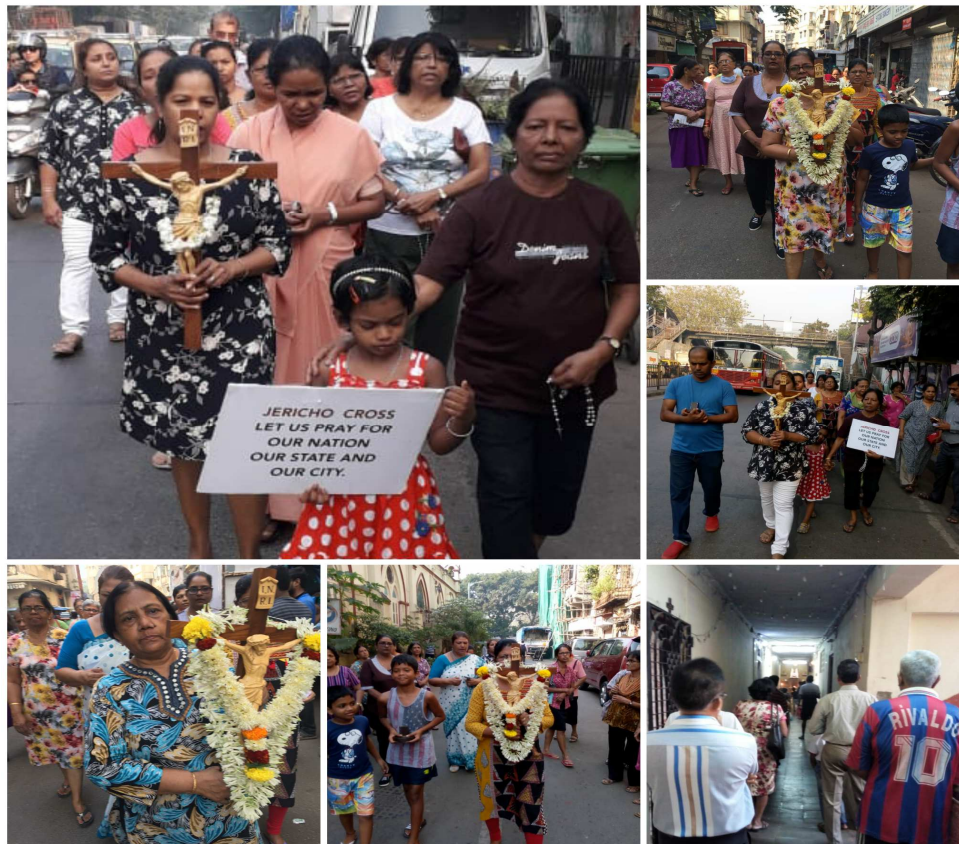
On 19 th November Jericho Cross was brought in procession from St. Francis Xavier Church, (Dabul) to Our Lady of Dolours Church, (Sonapur, Marine Lines), and installed in our Church. Thereafter it taken in procession to all the Communities in our parish beginning with St. Jude's community in AP building.