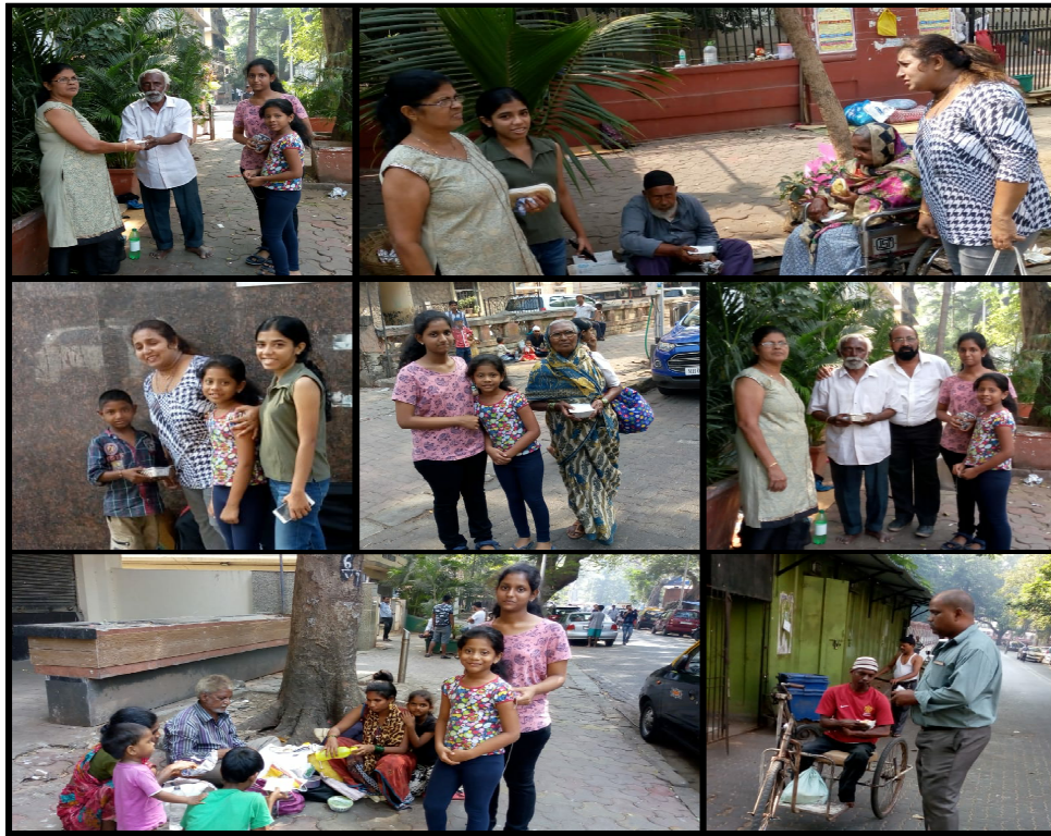
On the occasion of the world day of poor, the members of St. Jude's community, together with members of St. Theresa's Community, distributed food to the poor at New Marine Lines (Liberty Lane) on November 18, 2018.